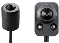
DS-2CD6412FWD-10 (Cylindrical sensor unit) DS-2CD6412FWD-20 (L-shaped sensor unit)