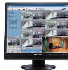
PIP (Picture in Picture)

The picture-in-picture or picture-by-picture capability allows a security manager to use a PC and view a CCTV camera at the same time. It could also allow the manager to always have a video of important camera in the corner at all times.