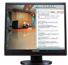
PBP (Picture by Picture)