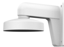
Wall mount DS-1272ZJ-110