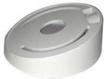
Inclined ceiling mount DS-1259ZJ